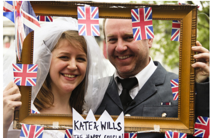
© Orla Byrne / London 3

A mixed media presentation of the New York City Projects will be showcased, alongside a selection from the São Paulo and London City Projects.