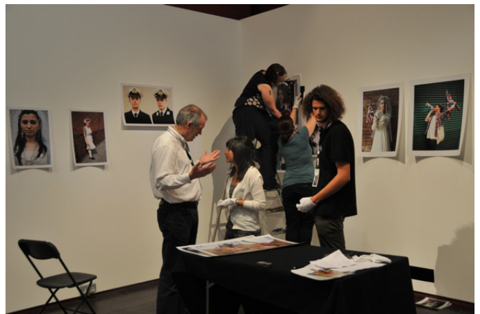
© London City Project workshop, 2011 10